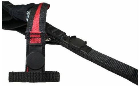
Fig 1 Trimmer

stop the trimmer webbing from flapping, as it can then be secured.