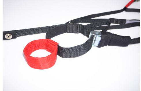
Fig. 6. Trimmer

The trimmer allows you to fly with the best glide when closed. Open your trimmer to take advantage of the "dive" or to lose altitude. To adjust the trimmers in flight, keep the brake handles in your hands and operate the trimmers symmetrically. If you adjust the trimmers asymmetrically (e.g. if you open one at a time) your MIRAGE 2 RS will fly an aggressive turn to the side of the closed trimmer. The rubber band also prevents the trimmer ribbon from fluttering when the trimmers are closed, as it fixes it in place.