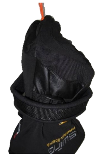
Fig. 3. Back view of Fig. 2