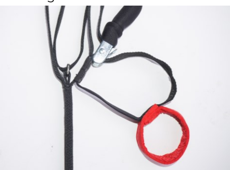
Fig. 7. Trimmers closed

Open trimmers: more "Speed & Dive" (Dive with open brakes)