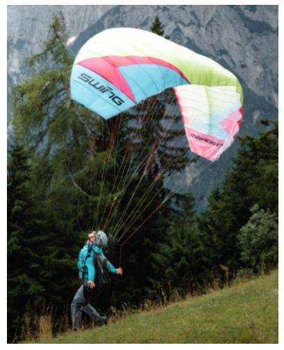
Fig. 10. Braking during start

With the MIRAGE 2 RS it is not necessary to take the A-risers in your hand when launching with skis. On the contrary, if you hold the A-risers at take-off, the MIRAGE 2 RS may surge forward.