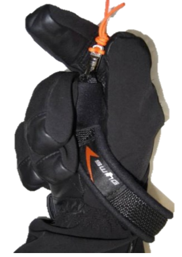
Fig. 2. Recommended variant; hand guided through brake loop