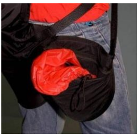
Fig. 9. Speedbag-bags on your SWING Speed Harness

After the last run of the day, you can also fix the risers to the speedbag's webbing by pulling the webbing through the riser loops.