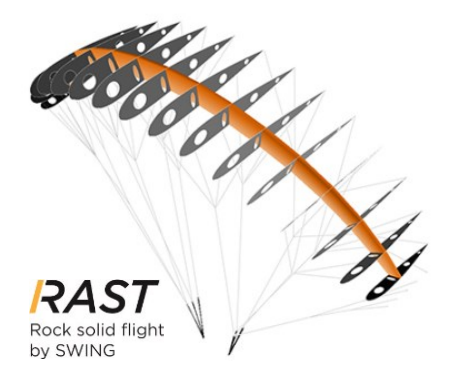
Fig. 1. Sketch RAST

This system divides the interior of the paraglider into several chambers crossways to the flight direction.