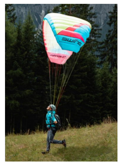
Fig. 11. Braking during control look

It is best to take off with the brakes in your hands only, about 30% applied. As soon as the MIRAGE 2 RS is above you, apply the brakes strongly and briefly to prevent it from shooting forward. At the same time, you can take the indispensable control look.