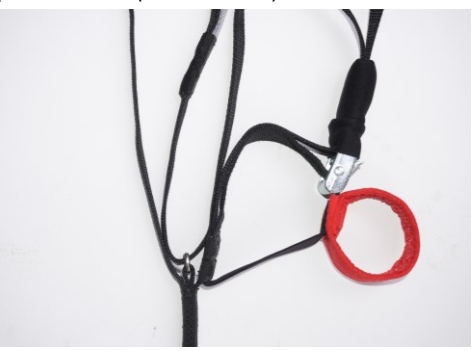
Fig. 8. Trimmer opened

Open trimmers: more "Speed & Dive" (Dive with open brakes)